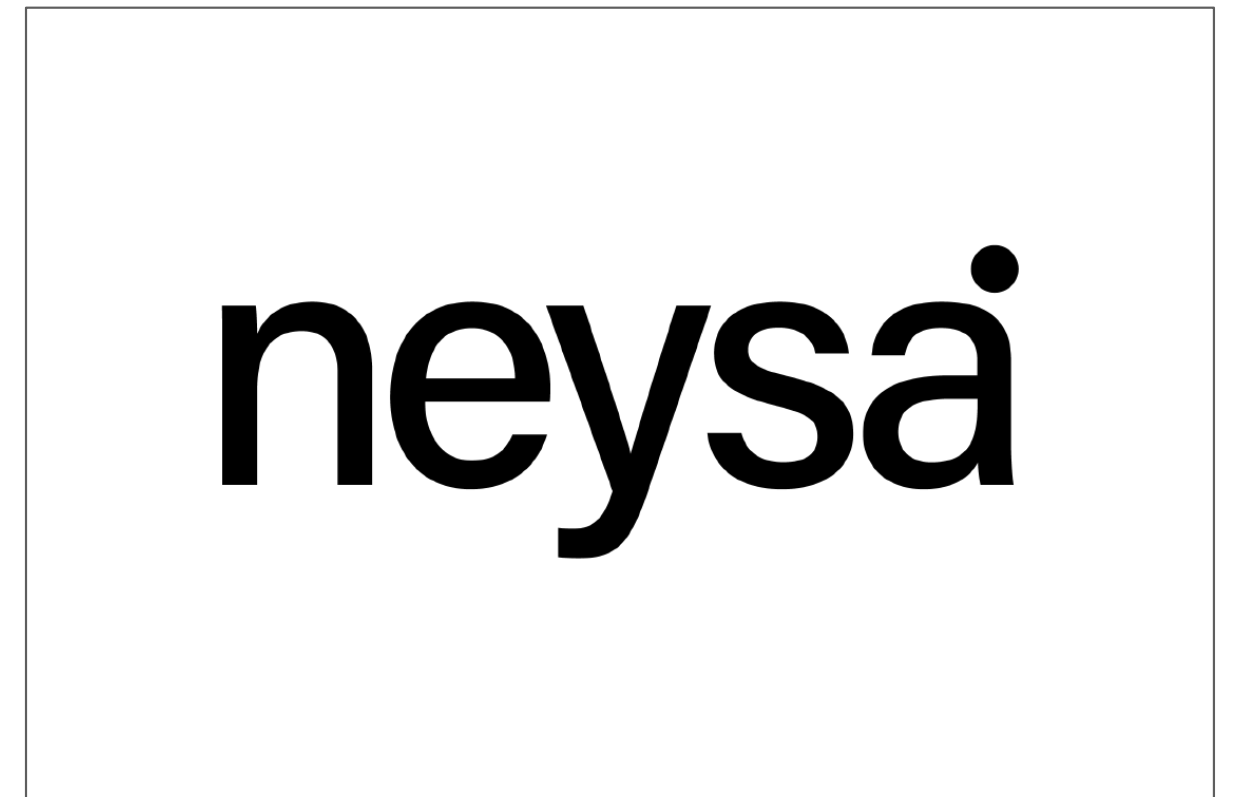
Single Colour Logo

To be used only in case of single-colour printing